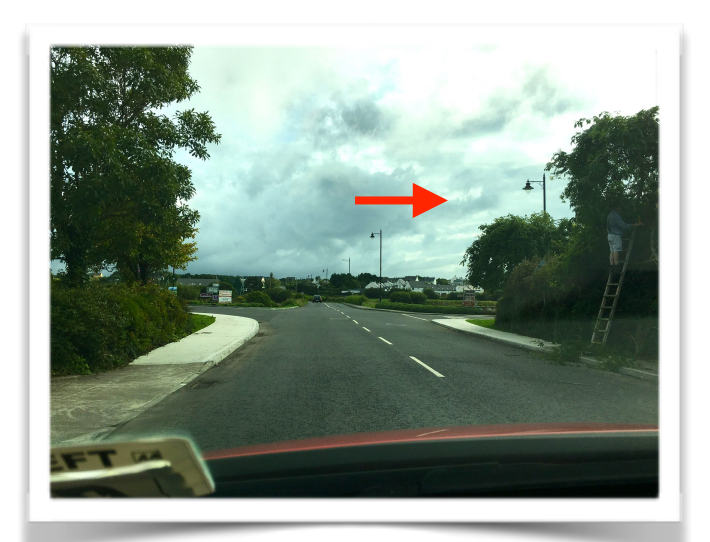
2/ After you go over the bridge take the first right towards Carrowmore Beach