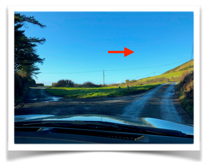
5/ Carry on straight along the road and take the next turn to the right at the fork.