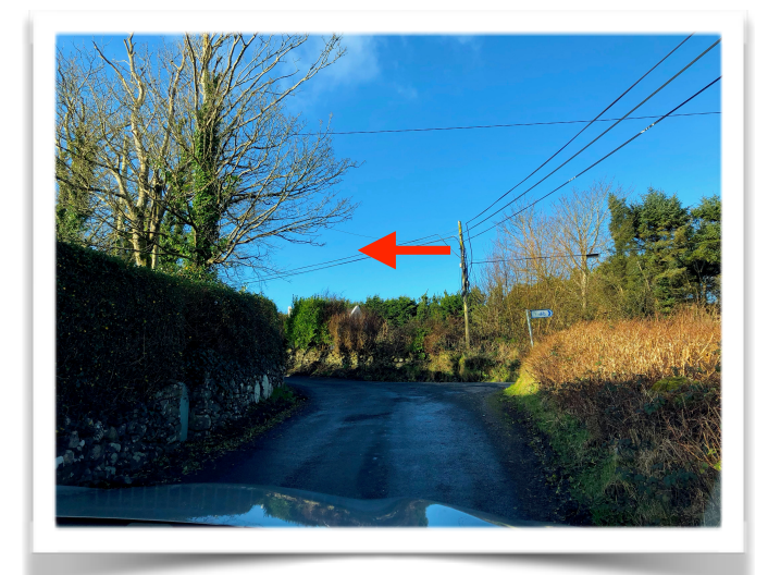
4/ As you go uphill the road splits right/left - take the left.