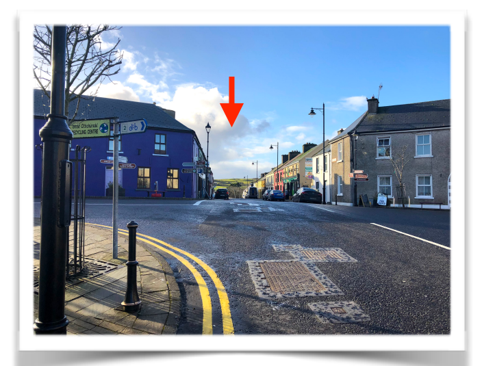
From Westport go straight through Louisburgh crossroads and downhill.