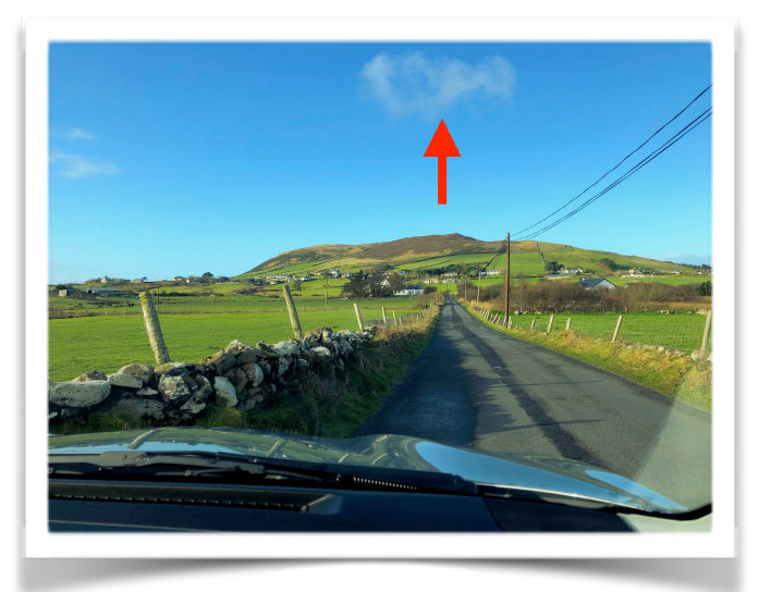
3/ Go straight on, you will pass a right turn to Carrowmore beach but you carry on straight.