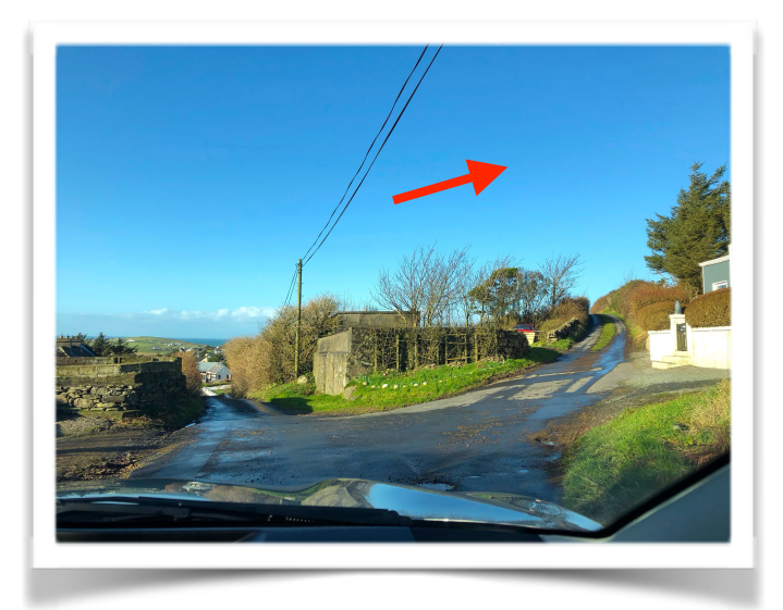
6/ And then at the next junction you also take the uphill road to the right.